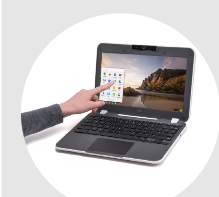
NL61T and NL61TX have an IPS 10-point capacitive touch screen.